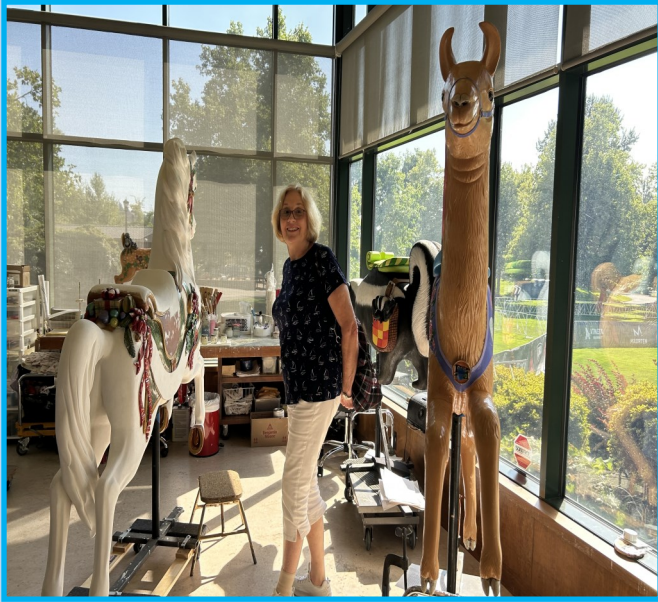
Seeing the sites of Oregon