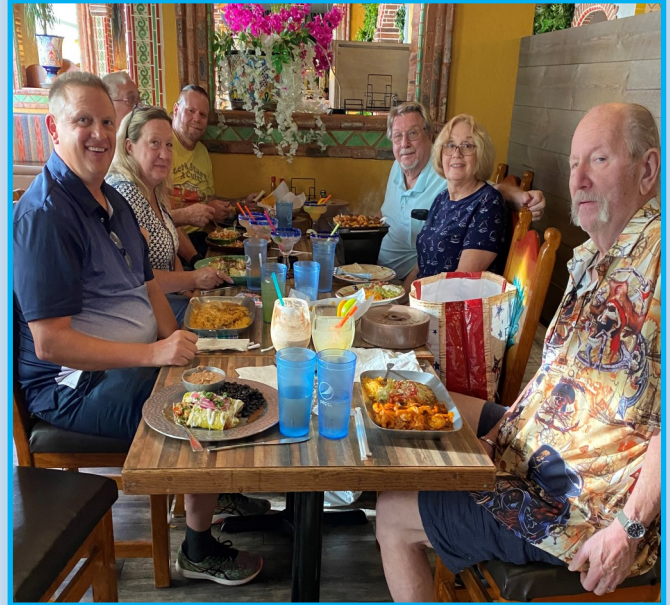
Lunch at a Mexican Restaurant