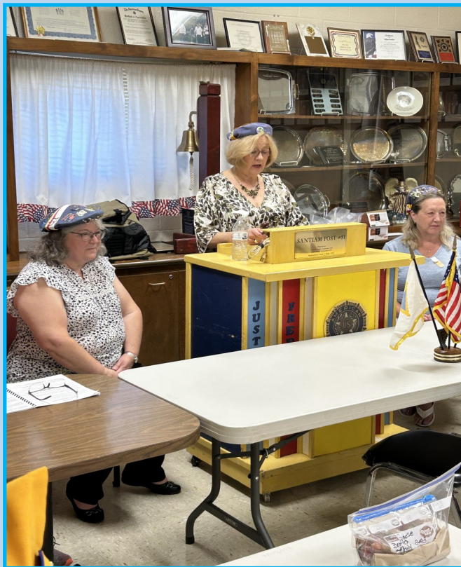
Installation of Officers—Grande du Oregon